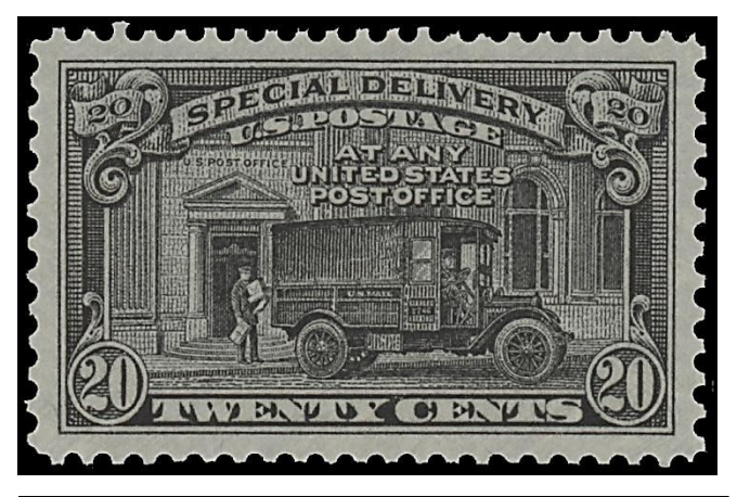
Figure 8.25. 20¢ Postal Truck (rotary press), 1951.

Scott #E19: 20¢ Postal Truck (Rotary Press)