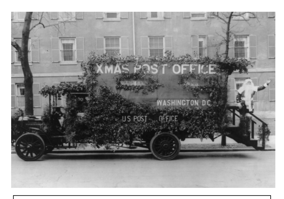
Figure 8.19. Postal truck in holiday garb, 1921. Courtesy The Library of Congress, LC-USZ62-94269.

based on a photograph of a Pierce Arrow truck in front of the old City Post Office in Washington, D.C. More than thirty million of these stamps were issued.