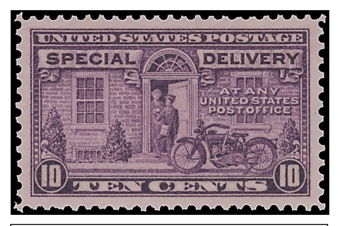
Figure 8.20. 10¢ Motorcycle Messenger (rotary press), Scott #E15, 1927.

Scott #E15: 10¢ Motorcycle Messenger (Rotary Press)