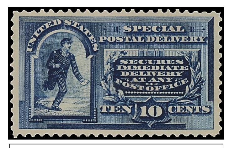
Figure 8.4 . 10¢ blue Running Messenger with "Any Post Office", 1888.

Scott #E2: 10¢ Blue Running Messenger with "Any Post Office"