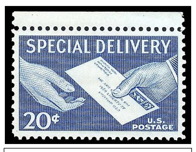
Figure 8.26. 20¢ Hand to Hand, 1954.

In 1954, a new Special Delivery stamp design was released, featuring a postal carrier handing a letter to a customer. What makes this image intriguing is that the stamp itself is pictured affixed to the envelope. The second stamp on the envelope is a three cent Liberty stamp that had been issued a few months earlier. Appropriately, the address on the envelope is "1954 Liberty St."