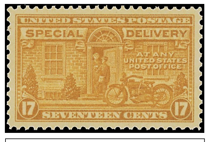
Figure 8.24. 17¢ Motorcycle Messenger, 1944.

In November, 1944, Special Delivery rates rose to 17¢ for parcels under two pounds, leading to the release of a 17¢ Motorcycle Messenger stamp on October 30<sup>th</sup>.