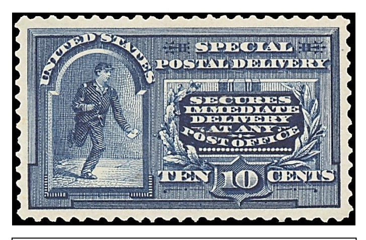
Figure 8.6 . 10¢ blue Running Messenger, Bureau of Engraving and Printing issue, 1894.

Scott #E4: Running Messenger 10¢ Ultramarine (Bureau of Engraving and Printing)