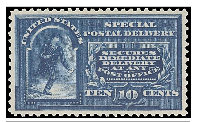
Figure 8.7 . 10¢ blue Running Messenger, double-line watermarked, 1895.

In 1895, the Scott #E4 stamp was re-printed on paper watermarked with "USPS" in a double line. In 1911, this double-line watermark was replaced with a single-line one.