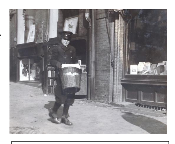
Figure 8.2. Boston Special delivery messenger, 1917. Courtesy The Library of Congress, LC-DIG-nclc-03986.

The first stamp in the series (Scott #E1) bears the words, "Secures immediate delivery at a special delivery office," reminding the user that Special Delivery