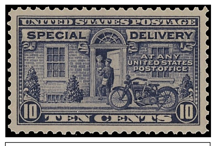
Figure 8.16. 10¢ Motorcycle Messenger, deep ultramarine (Scott #12A), 1922.

Scott #E12 and #12A: 10¢ Motorcycle Messenger (Ultramarine and Deep Ultramarine)