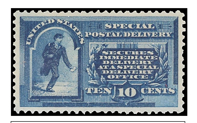
Figure 8.3 . 10¢ Running Messenger with "Special Delivery Office", 1885.

Released in 1885, this first Special Delivery stamp was engraved and printed by the American Bank Note Company of New York. It is the one most sought-after by Special Delivery stamp collectors today; about 6,634,450 were issued. The 1885 Ten Cent Blue Running Messenger was recently ranked #34 in a book on the