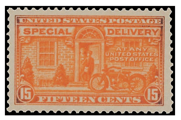
Figure 8.17. 15¢ Motorcycle Messenger, 1925.

After forty years of Special Delivery service, rates were finally raised in 1925. Rates for parcels less than two pounds remained at ten cents, but the price for parcels from two to ten pounds went up to fifteen cents, and the rate for the heaviest parcels rose to twenty cents. While the twenty-cent price could