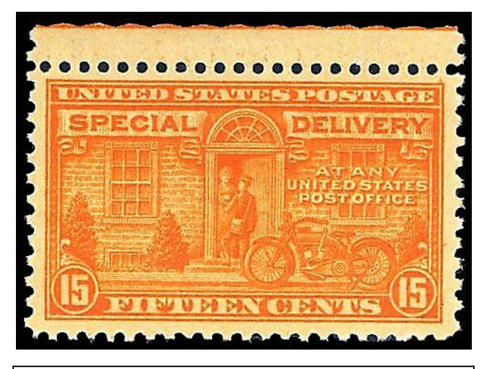
Figure 8.22. 15¢ Motorcycle Messenger (rotary press), 1931.

The fifteen cent Motorcycle Messenger was released as a rotary press stamp (perf 11 by 10 ½) on August 13, 1931. The rotary press issue can be distinguished from the earlier one (#E13) by its lighter shade of orange and gum breaker ridges.