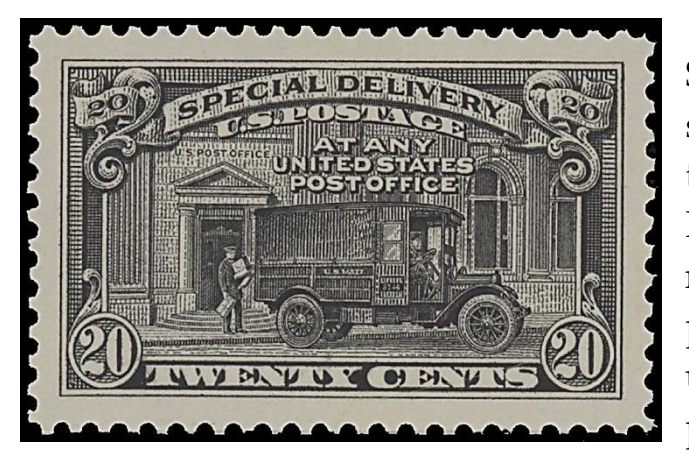
Figure 8.18. 20¢ Postal Truck, 1925.

Released on April 25, 1925, Scott #E14 was the third U.S. stamp to feature an automobile – this time, a postal delivery truck. Initially intended to pay for the new rate for Special Delivery packages over ten pounds, it was used to pay the adjusted fee for packages between two and eight pounds after rates were raised again in 1928. The design was