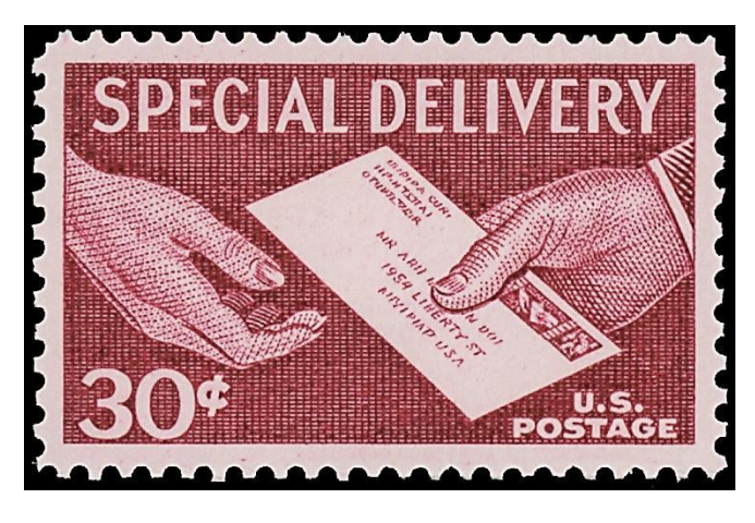
Figure 8.27. 30¢ Hand to Hand, 1957.

An increase in Special Delivery rates prompted the issue of a new stamp on September 3, 1957. The Hand to Hand stamp design was reused, with the denomination increased to thirty cents and the color changed to lake.