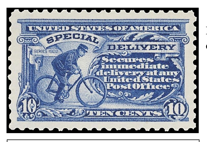
Figure 8.12. 10¢ Bicycle Messenger, perf 10, 1914.

This 1914 issue of the Bicycle Messenger is perf 10 instead of the earlier perf 12.