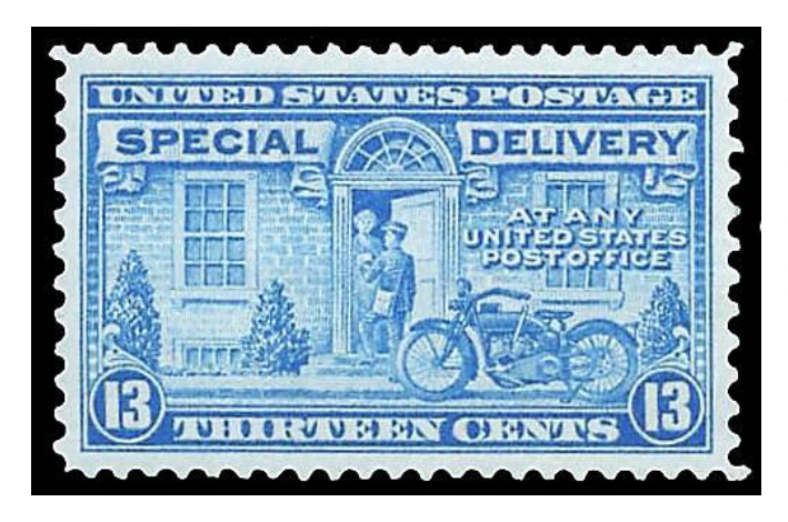
Figure 8.23. 13¢ Motorcycle Messenger, 1944.

In November, 1944, Special Delivery rates rose to 13¢ for parcels under two pounds, prompting release of a 13¢ Motorcycle Messenger stamp on October 30<sup>th</sup>.