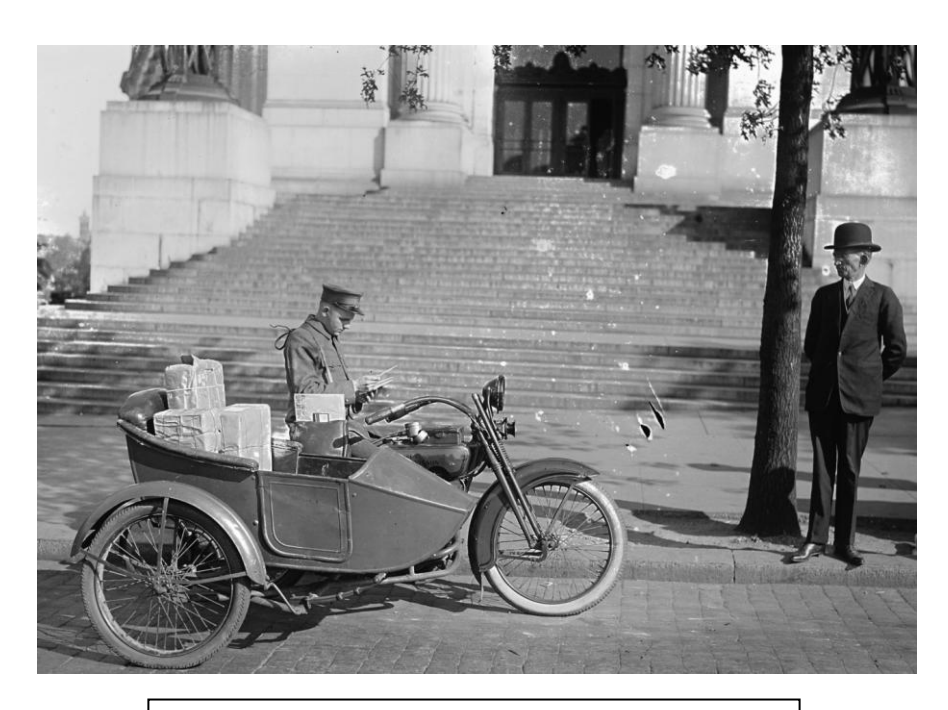
Figure 8.1 . Special delivery, circa 1924. Courtesy The Library of Congress, LC-DIG-npcc-26292.

While the Parcel Post stamps were in use for less than one year, the Special Delivery series had a much longer run, from 1885 until 1997. Special Delivery was a service that insured much faster mail delivery than provided by the standard delivery service. At first restricted solely to post offices in urban areas, Special Delivery was extended to all 4,000 U.S. post offices on October 1, 1886. In order to be valid, a Special Delivery item required an additional special stamp indicating that the service had been purchased along with regular postage. Special Delivery service consisted of a single attempt at delivery of an item to the intended recipient. If that recipient was unavailable at the time of the delivery attempt, the item would automatically revert to regular mail instead. Priority Mail and Express Mail permanently replaced the Special Delivery system in June of 1997.