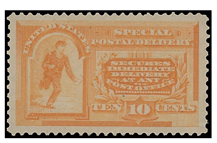
Figure 8.5. 10¢ orange Running Messenger with "Any Post Office", 1893.

The last Special Delivery stamp by the American Bank Note Company, Scott #E3 was a re-printing of Scott #E2 in orange instead of ultramarine. It was issued in February, 1893. The purpose of this color change was to enable it to be distinguished more easily from the one-cent blue Columbian recently issued.