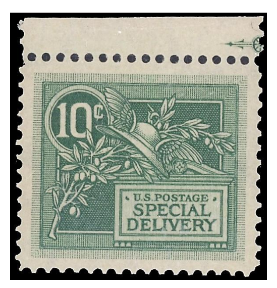
Figure 8.9 . 10¢ "Merry Widow", 1908.

Released on December 12, 1908, the "Merry Widow" had the shortest lifespan of any Special Delivery stamp ever printed. Designed by New York architect