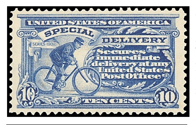
Figure 8.8. 10¢ Bicycle Messenger, 1902.

As a step up in technology, Scott #E6 (issued December 9, 1902) featured a messenger on a bicycle, based upon a photograph of the stamp's designer, Raymond Ostrander Smith. The inscription "Series 1902" was retained on all stamps in this series for twenty years, until a new design was released in 1922 (Scott #E12).