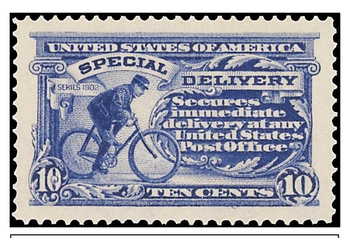
Figure 8.11. 10¢ Bicycle Messenger, single-line watermarked,1902.

Scott #E8: 10¢ Bicycle Messenger with Single-Line Watermark